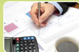
DPR and FUPs