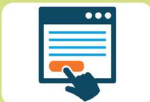
Application for the Subsidy