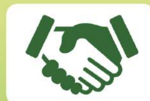
Branding & Marketing