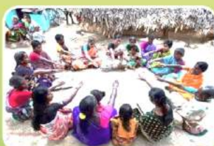
Support to FPOs/ SHGs/ Cooperatives